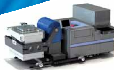
Test head service position