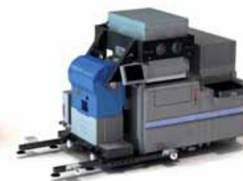
Test head in docked position