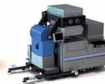
Lower test head 150 mm