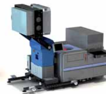
Rotate test head 180°