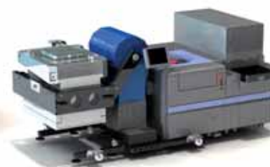
Lift test head 150 mm